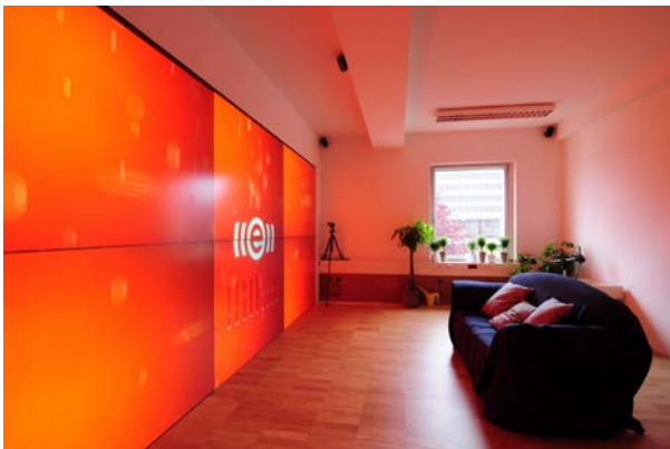
(a) A view of the ambient assisted living lab.