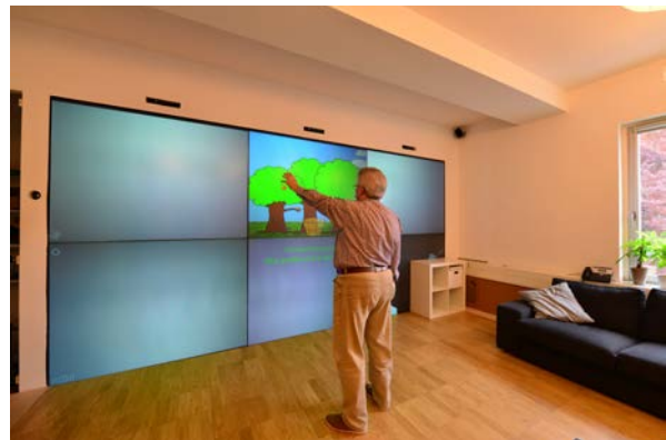
(b) Participant interacting with a game prototype.