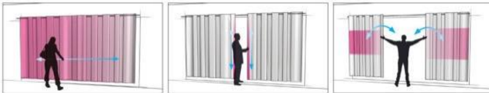
Figure 1: Possible ways of interacting with an augmented curtain. The gestures on the left and on the right are taken from traditional curtains, whereas the middle one relates more to vertical persian blinds. In this paper, we built on the interaction on the right.

The interaction is designed similarly to how you would draw a curtain open in the morning, with a large swipe from the center to the outside (see Figure 1). As motorized curtains are usually installed on large windows, the user cannot cover the entire surface of the curtain with one gesture. Furthermore, it should be possible to open the curtain at different granularities. We designed a sensing pattern that allows both coarse and fine input.